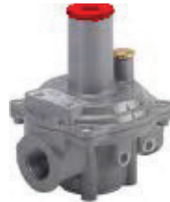
STANDARD MODEL Inlet Pressure Range: 3" W.C. to 15 PSIG