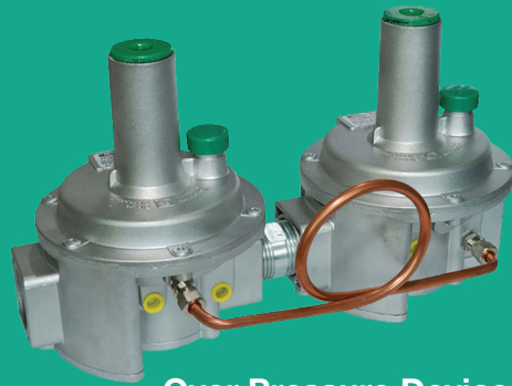
Over Pressure Device (OPD) Worker + Monitor