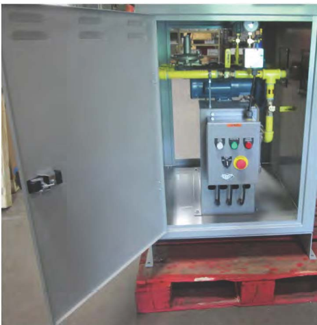
E101P in Outdoor Transclosure